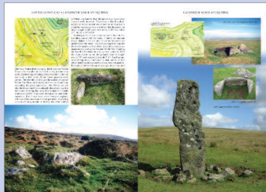
Example of a double-page spread.