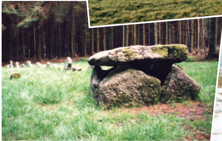
The cairn and cist to the south-east of Lakehead Hill.