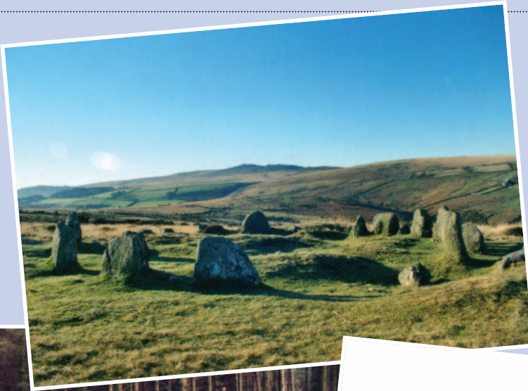
Belstone cairn Circle.