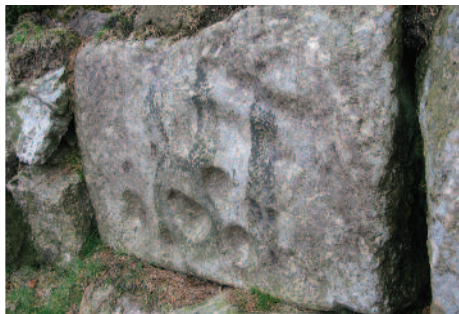
The Long Plantation cup stone.